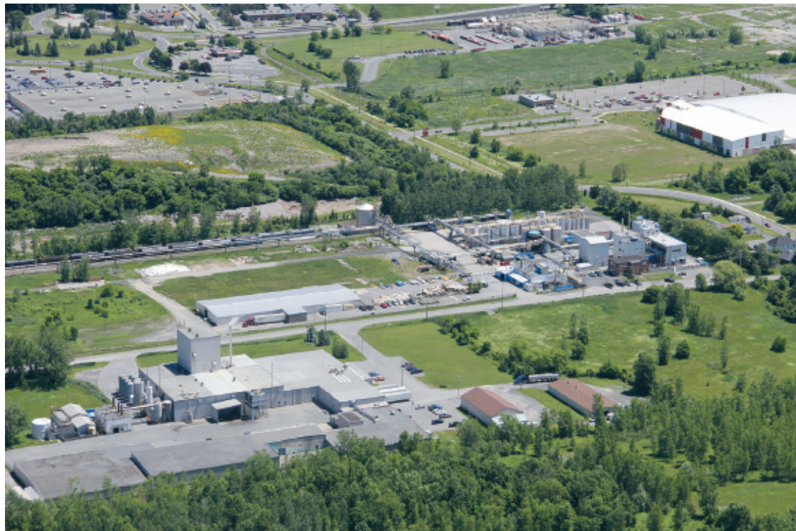
Cornwall is home to some of the world's most progressive manufacturers.

Some manufacturing operations may also require a Certificate of Approval from the Ontario Ministry of the Environment.