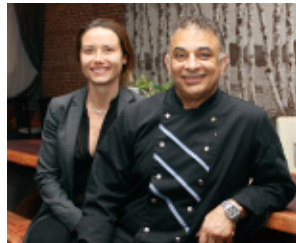
Table 21 Opens

BTB plans to build a new 110,000 sq.ft. commercial plaza at the corner of Marleau and Boundary on an existing 15 acre site. The new development will accommodate commercial and service industrial uses.