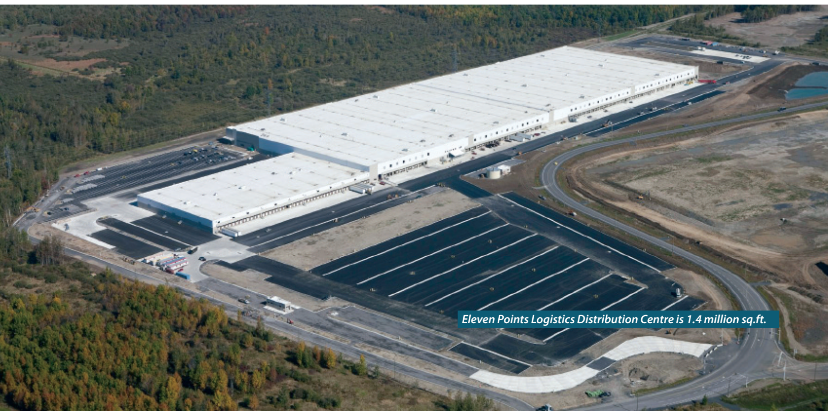
Eleven Points Logistics Distribution Centre is 1.4 million sq.ft.

Eleven Points Logistics continues to hire staff for a variety of positions as it builds its workforce. For more information on working at the Cornwall Distribution Centre, please visit www.EPLjobs.ca .